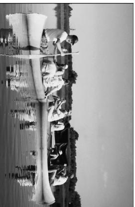
A canoe trip of the Collins Marsh Wildlife Area offers a serious look at the importance of wetlands and wildlife.

The three-day program will provide an opportunity to explore the fundamentals of Forest and Terrestrial Ecology, Aquatic Communities, and Soil and Land Use. A hands-on Project Wild sessions is included in the Workshop and is underwritten by the FORWARD Endowment of Manitowoc County.