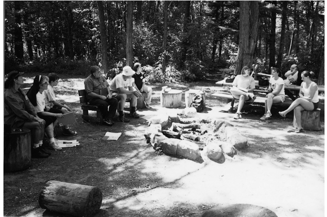
Participants take a break around the fire pit.